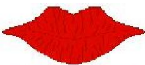
long vertical grooves