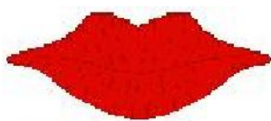
short vertical grooves